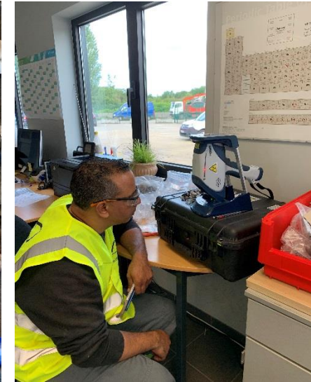
Sampling and analysis of separated thermoplastics fragments on Comet Traitements industrial site.

This material will be shipped to ULiège for testing and calibration of PICKIT automated multi-class sensor-based sorting and separation pilot line.