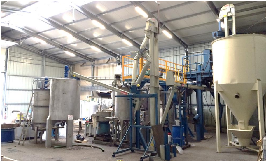
Froth flotation installation on Comet Traitements industrial site to be used in in LIFE PlasPLUS project.

This material will be shipped to ULiège for testing and calibration of PICKIT automated multi-class sensor-based sorting and separation pilot line.