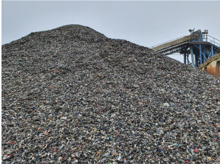
Plastic-rich shredder residues stockpiled on Comet Traitements industrial site to be treated in LIFE PlasPLUS project.